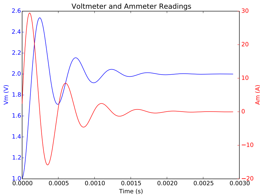
Figure 3: Capacitor voltage and current waveforms

import matplotlib.pyplot as plt plt.close('all') x = [i * data1['sampleTime'] for i in range(0, len(data1['data']))] fig, ax1 = plt.subplots() ax1.plot(x, Vm, 'b') ax1.set_xlabel('Time (s)') ax1.set_ylabel('Vm (V)', color='b') ax1.tick_params('y', colors='b') ax2 = ax1.twinx() ax2.plot(x, Am, 'r') ax2.set_ylabel('Am (A)', color='r') ax2.tick_params('y', colors='r') plt.title("Voltmeter and Ammeter Readings") plt.show()