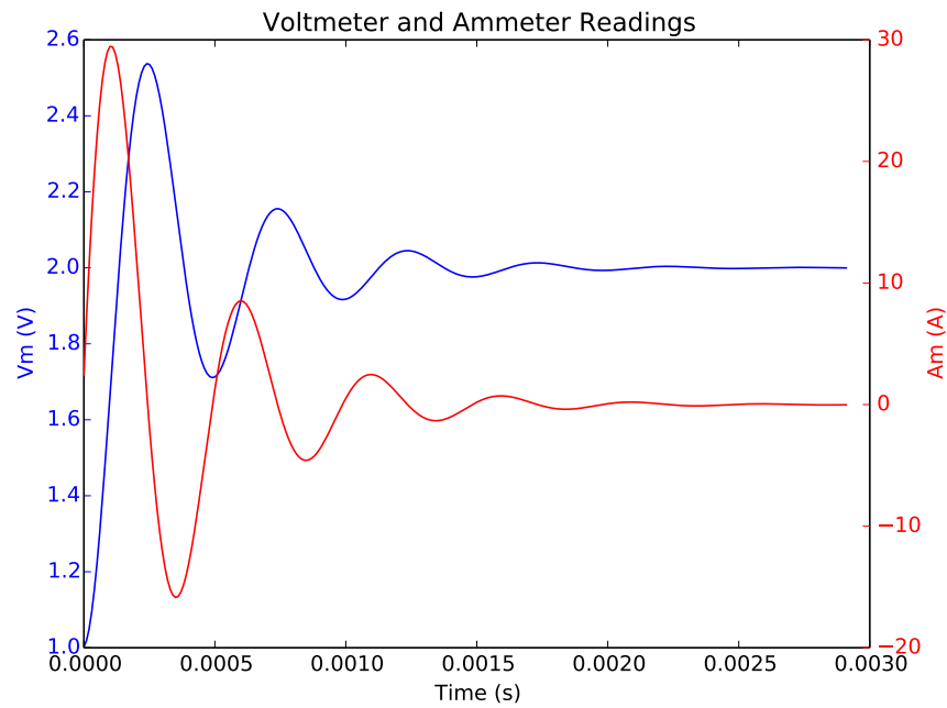
Fig. 3: Capacitor voltage and current waveforms